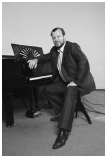
National artist of Russia Federation

rofessor of Moscow men of the creati ctivists of the arts: 1, Honorary Artists kov, members-corre es and Arts, Pec Artist of Russia, P. ! students in the de and international edia means and in s