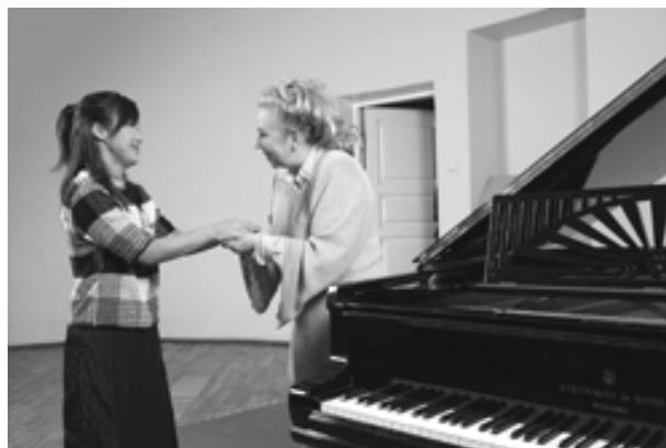
National artist of Russia Federation